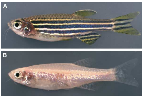
Figure 1. Zebrafish Adult Pigment Pattern (A) Phenotypically wild-type, heterozygous nacre and (B) homozygous nacre .

erence for the pigment pattern phenotype of prospective shoaling partners. Our results show that control subject fish exhibited a strong, positive, assortative preference for their own phenotype: wild-type preferred wild-type and nacre preferred nacre (Figures 3A and 3B). Thus, zebrafish are able to distinguish between alternative pigment pattern phenotypes visually, and there is a strong preference to shoal with individuals of like phenotype. This result suggested either an effect of early environment or a major effect of nacre or another closely linked locus on the preference exhibited by subject fish.