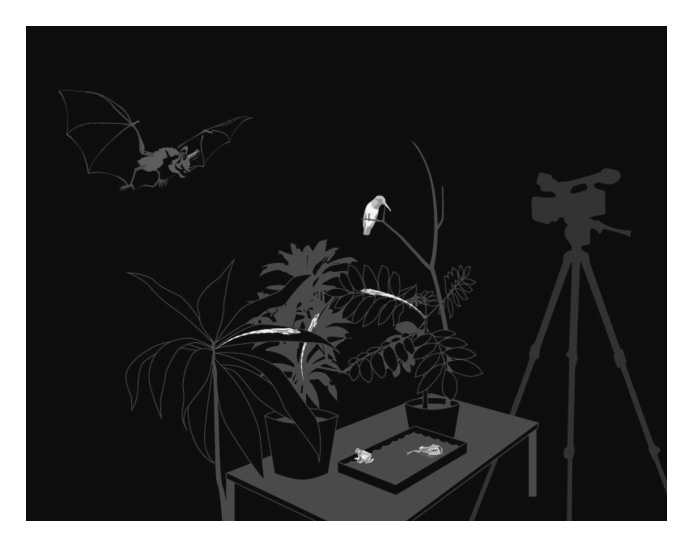
Figure 1 Testing setup with 3D models. Illustration by Damond Kyllo.

The two gene regions differed in the number of samples from which sequences were amplified and the types of prey organisms identified (Table 1). The 16S region identified amphibian DNA from more fecal samples and of more anuran species than the CO1 region, and CO1 identified more reptilian ( Anolis lizards) and insect prey from more fecal samples (Figure 2). In some samples, the same prey species was amplified by both gene regions. A combined total of 65 bat fecal samples amplified DNA from prey species; 26