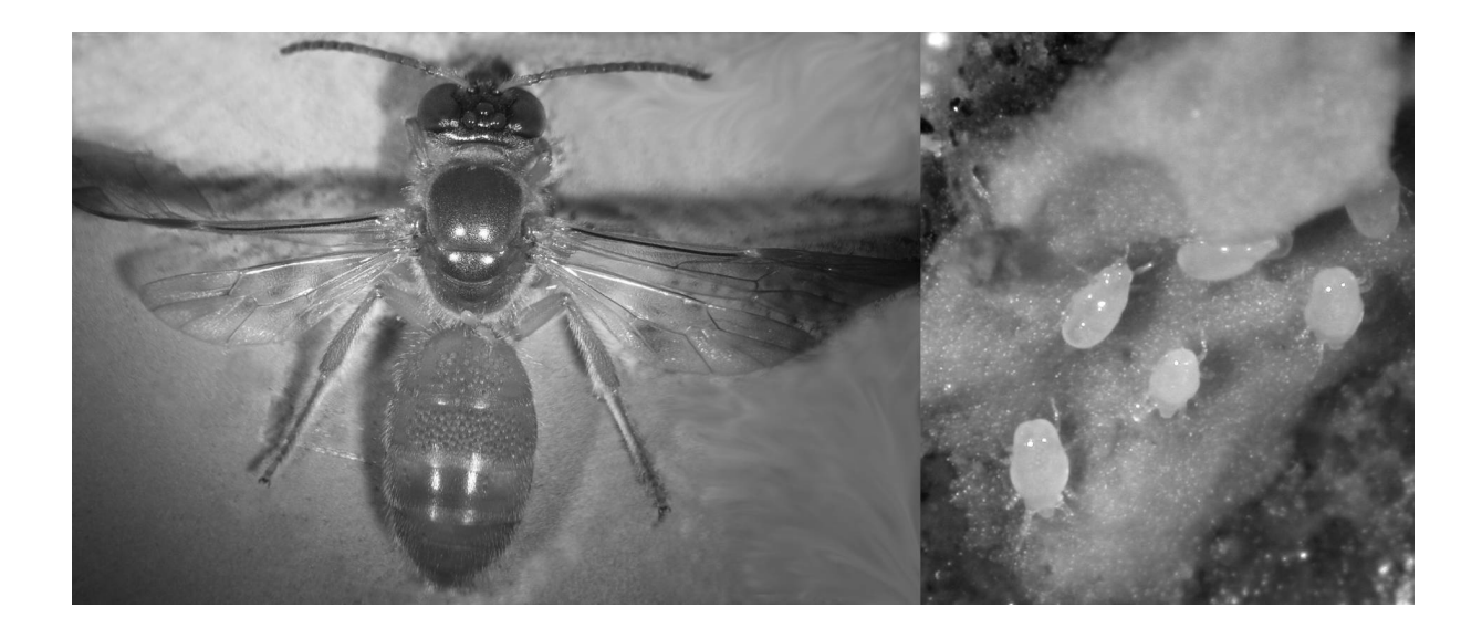
Left, Megalopta with two stages of mites. The tiny mites will remain attached to the bee and will eventually disperse into a new nest; the bigger mites will probably stay in their natal nest. Right, mites on pollen inside a brood cell.