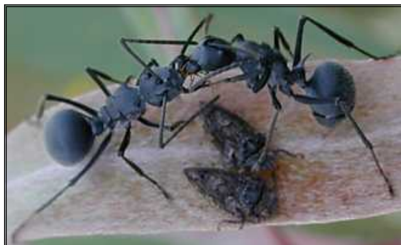
Polyrhachis schistacea +